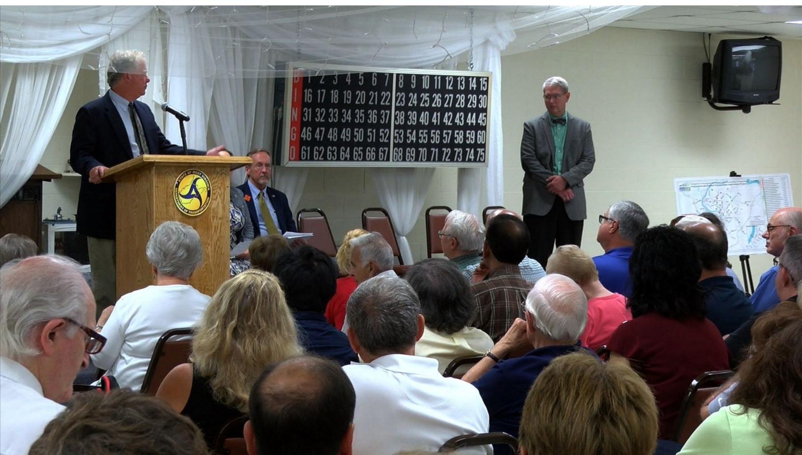
WVDOH/MMMPO Public Outreach (I-79 northern connector project I-79 northern connector project)