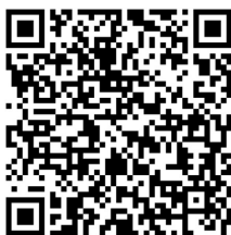
Project Survey QR Code