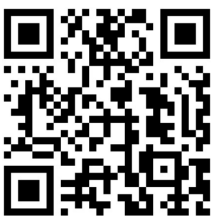
Website QR Code